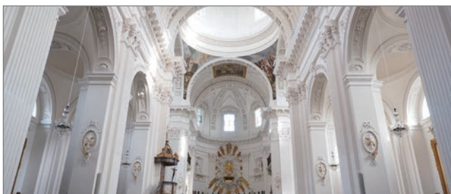
Houses of Worship